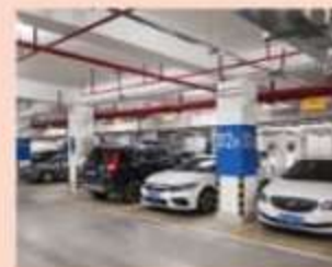
Covered Car Parking