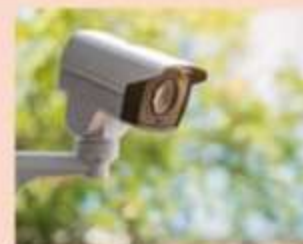
24x7 CCTV Surveillance