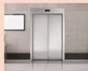
Lift with Battery Backup