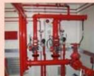
Fire Fighting System